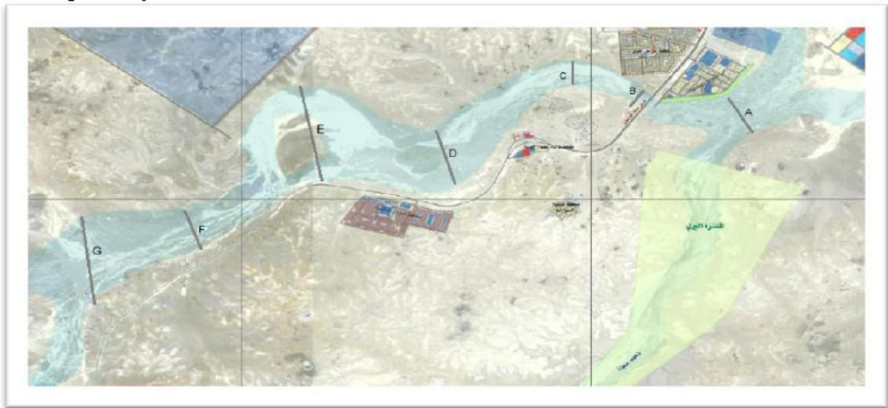
Fig. 1: Topographical plan of the studied area of Wadi Arar