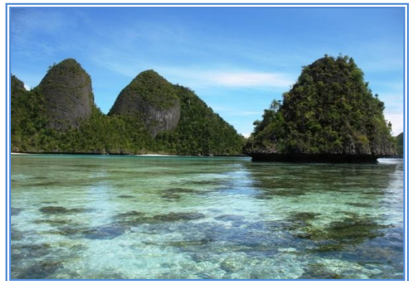
Fig. 3: The tower hill with height varrybetween 20 - 40m.

Commonly physical and biophysical environment of karst both on the surface as well as on the subsurface can only provide limited resourcesfor floraandfauna which live there. In the verry limited physical condition of karst Raja Ampat, the diversity of coral and fish are able to survive on bathymetry depth less than 15 monly within a few feet of the hill.